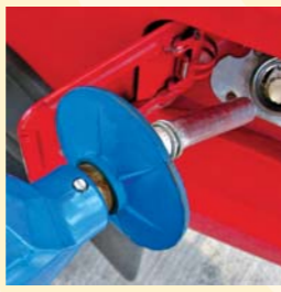
$50 Pump Pass