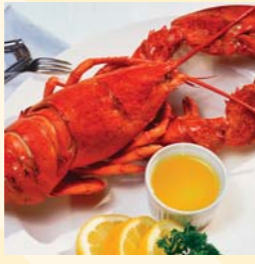
$50 Dinner Bonus